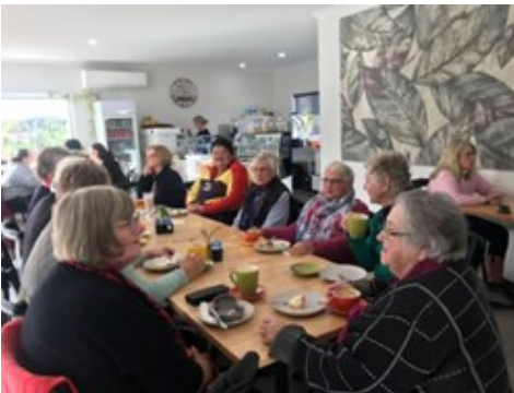
Ladies at afternoon tea