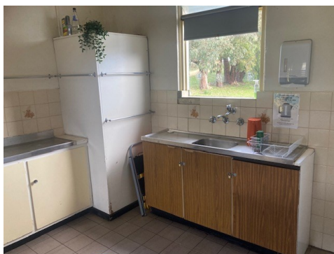
Karnkendi kitchen before the upgrade