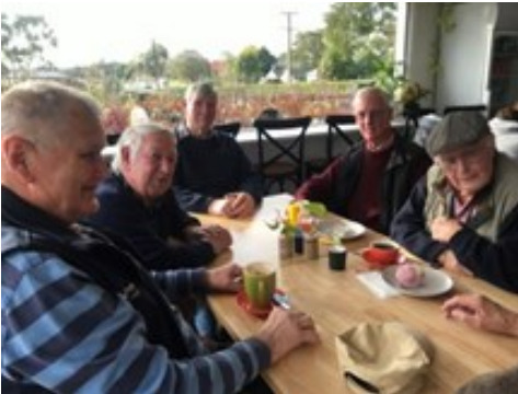
Men enjoying afternoon tea and fellowship

Many members of the congregation spent a great time of fellowship at the new café in Naracoorte, which is in the plant nursery and has a lovely outlook; it overlooks the plants, trees and roses etc. We had a table for the men so they could fellowship together and a table for the ladies. It was enjoyed by all who attended.