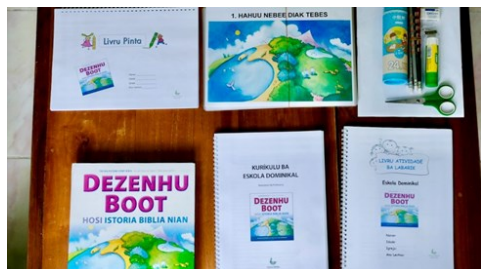
Scripture Union Sunday School Materials

children's ministry. In addition to these materials, there are approximately six other Bible resources in the pipeline.