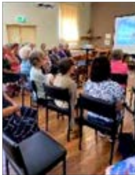
The group during the talk

At the end of January our KYB group hosted a Morning Tea. One CWCI Board member came from Adelaide to