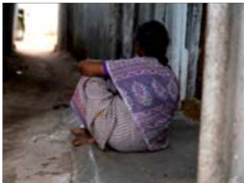
Satya photo from behind

*Name changed to respect identity and privacy