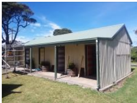
Karnkendi cabins new roof