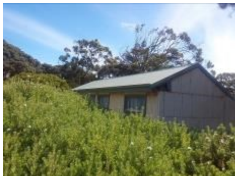
Karnkendi cabins new roof