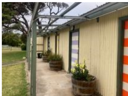
Karnkendi cabins timberwork