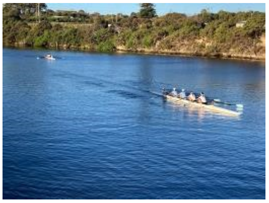
Seymour Girls Rowing

A brief update on what has happened our way. It was a very quiet lead up to Christmas 2022 which has now seen the busiest start to 2023 with a regular family group from Warrnambool / Koroit staying for Christmas and New year followed by a Thai family fellowship group from Melbourne, lovely indigenous family groups from Portland / Heywood then from the 18<sup>th</sup> to 29<sup>th</sup> of January the Seymour Girls College Rowing team with 84 on site and the Unley High Rowing from the 25<sup>th</sup> with 45 students, all from Adelaide.