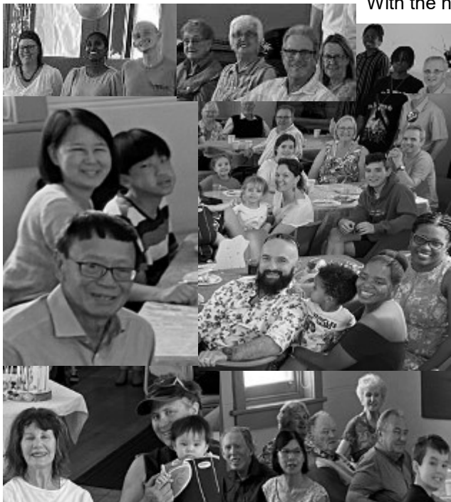
A recent congregation celebration