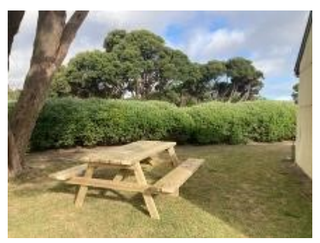
New Picnic Tables

We have inquiries for February from local schools at this time and the Mount Gambier Jubilee Christian Centre have booked with a Young Adults camp organised for 17<sup>th</sup> -19<sup>th</sup> of March. The Jubilee Christian Centre usually have at least one camp per year at Karnkendi.