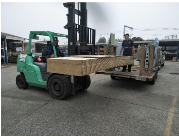
Flooring being loaded in Oakleigh South Melbourne onto a trailer for the journey home.