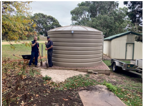
Final tank base work