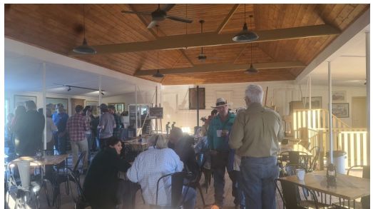
Enjoying breakfast following the service