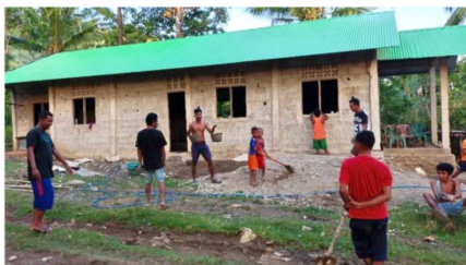
Viqueque Presbyterian Church building

Viqueque. You won't read it on the list of "must-see" tourist destinations should you ever have the privilege of visiting Timor Leste.