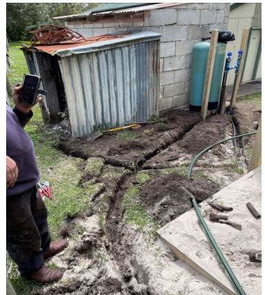
Karnkendi tank plumbing