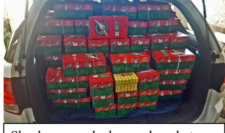
Shoeboxes packed up and ready to go

On 25 September, 142 filled shoeboxes were sent on the start of their journey to children in other countries. Considering the